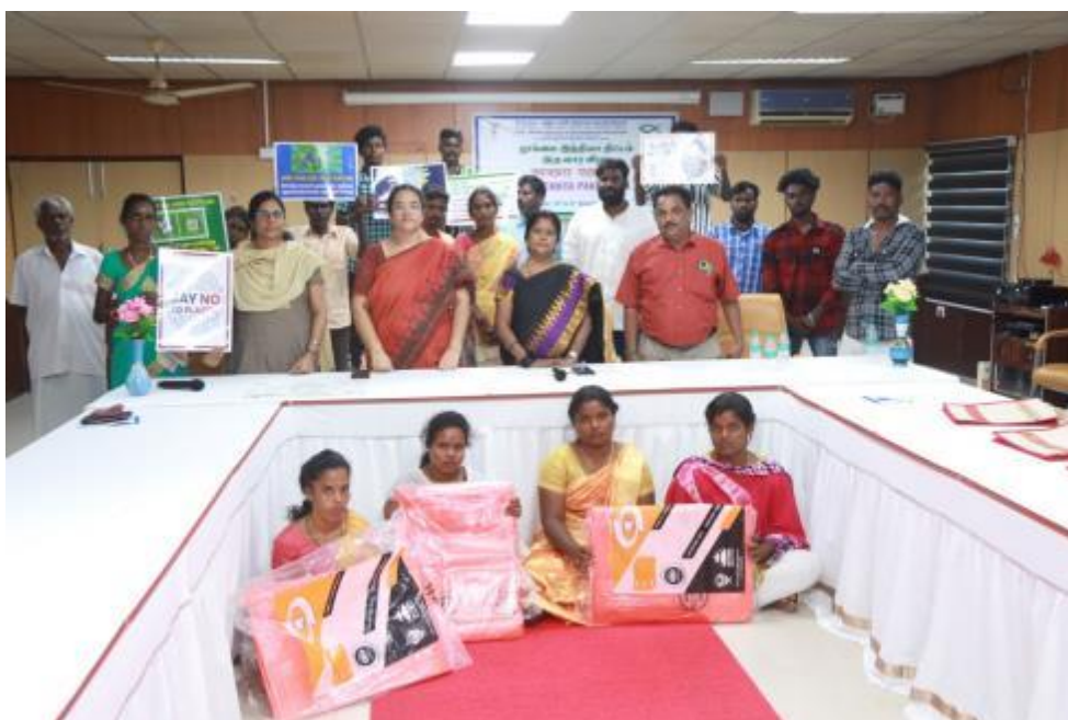
Distribution of Materials to pulicat farmers, Tamil Nadu