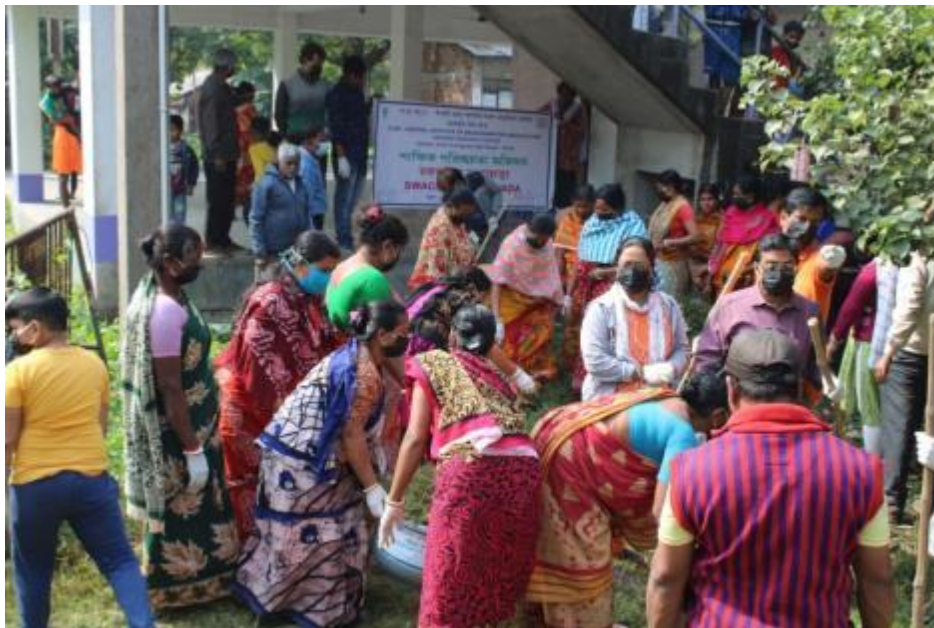
Cleaning drive in Haripur village, Kakdwip, West Bengal