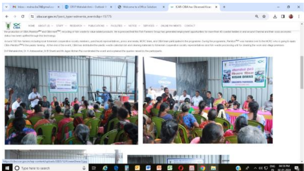
Swachhta Pakhwada activities are posted in Institute website