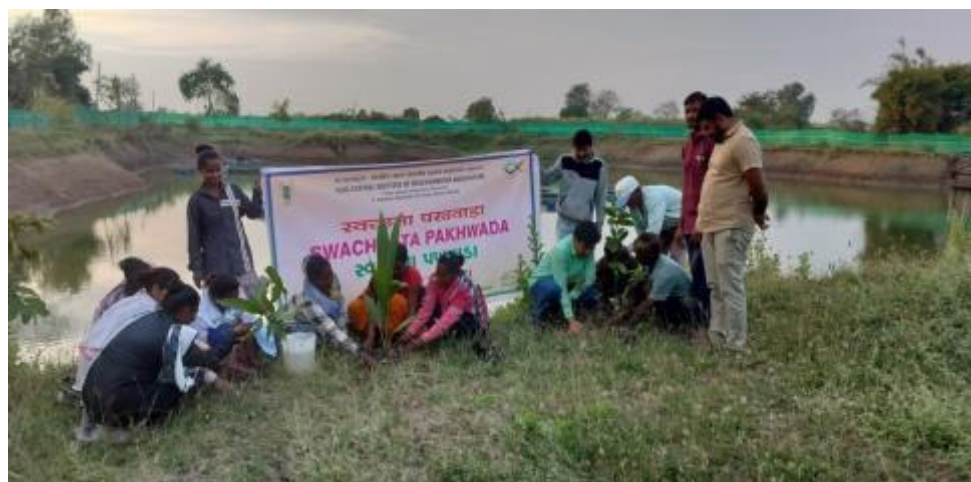
Planation of saplings by tribal farmers at Singod Village, Navsari, Gujarat