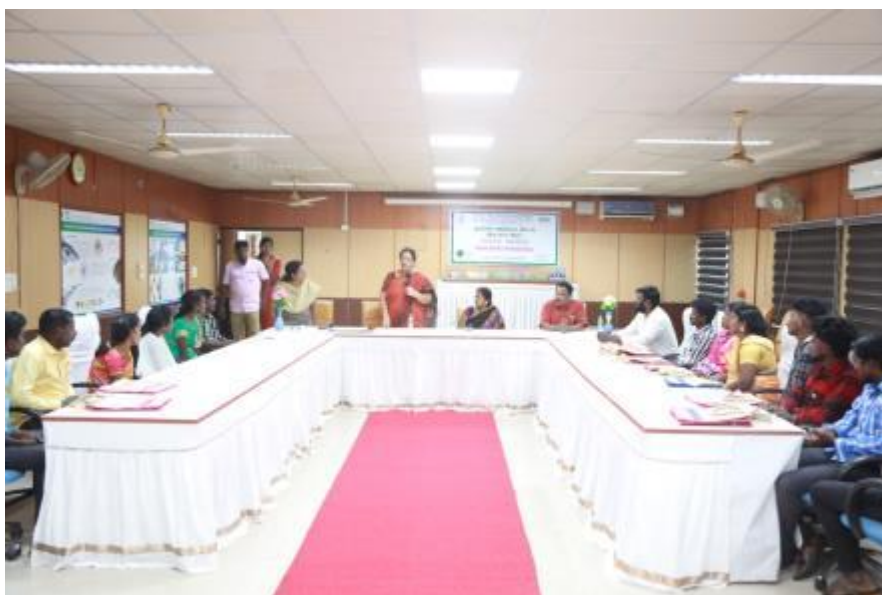
Awareness on safe disposal of degradable/non- degradable items and shut single use plastic among pulicat farmers, Tamil Nadu