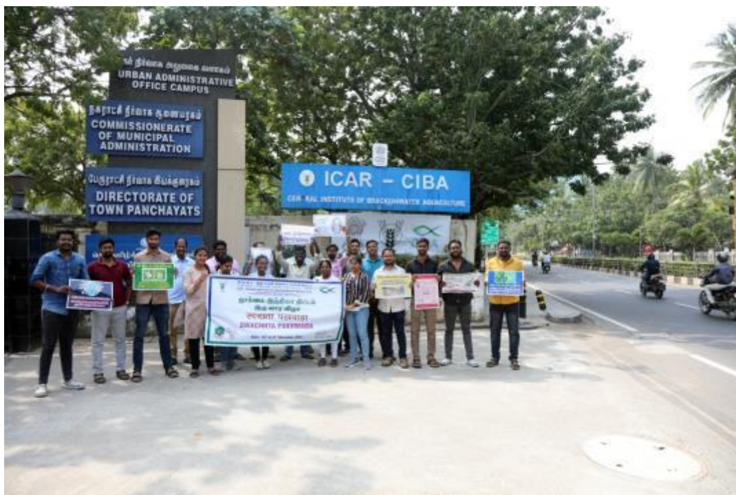
Rallies on shun single use plastics at Santhome High Road, ICAR-CIBA, Chennai