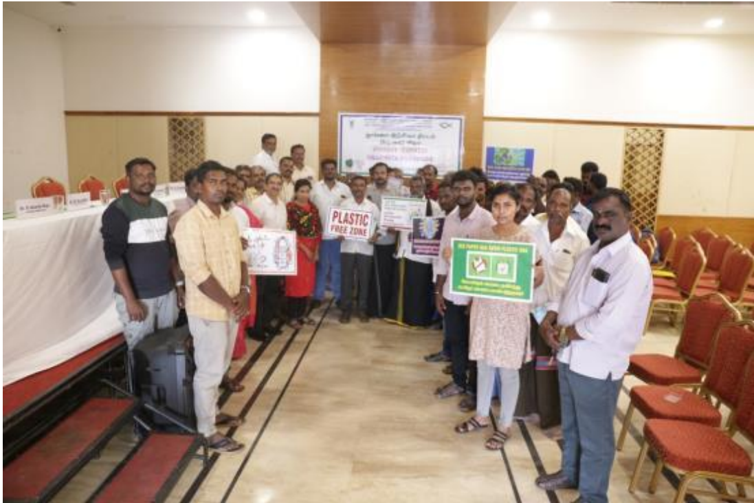
Community mobilization for plastic waste shramdaan - ICAR-CIBA, Chennai