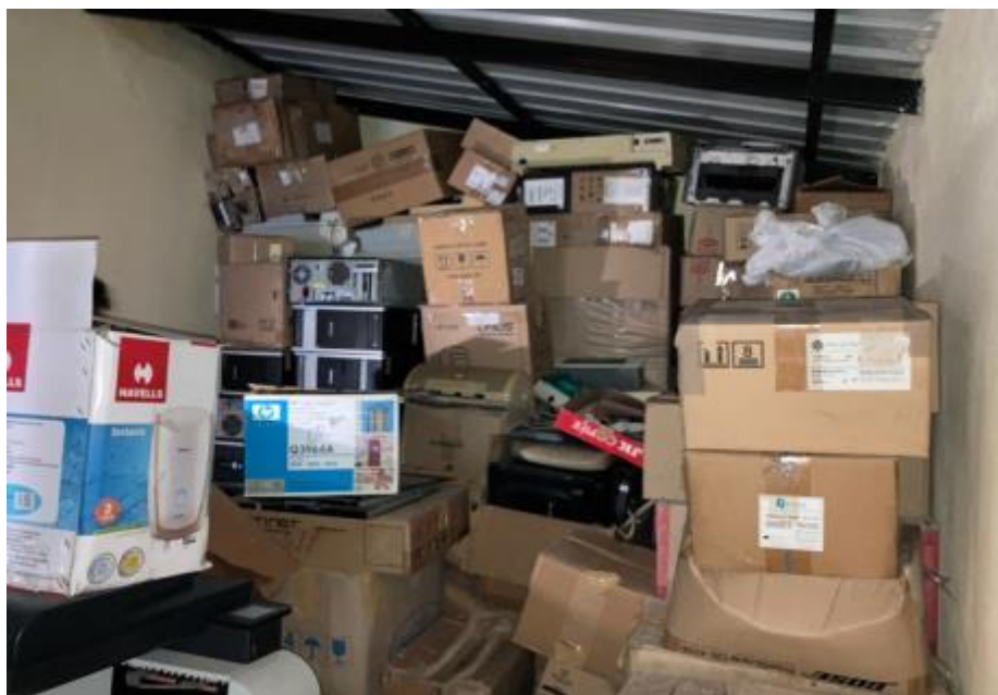
Unserviceable equipment and unrepairable furniture were identified and taken necessary action for disposing, ICAR-CIBA, Chennai, Tamil Nadu

The weeding out of the files and records from Stores, Administration, Audit and Accounts Section and Library and cleanliness drive in various laboratories and common places in the Institute premises including research centres at Gujarat and Kakdwip were undertaken. Unserviceable/scrap items to be condemned were identified and collected to a common place at Hqrs of CIBA, Chennai and going to be disposed as per the procedure. Around 64 CIBA staff and students were participant in these cleaning activities. The processing of files by the Administration, Audit & Accounts and Stores sections were carried out through e-office, being 100% implementation of e-office, this enabling paperless office.