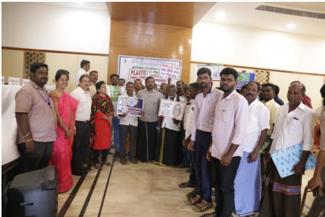
Community mobilization for plastic waste shramdaan - ICAR-CIBA, Chennai

ICAR-Central Institute of Brackishwater Aquaculture (CIBA), Chennai, organised an awareness campaign related with plastic waste shramdaan and cleanliness, hygiene and sanitation under Swatchhata Pakhwada in Maathampattinam