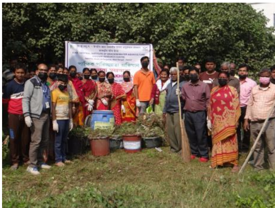
Cleaning drive in Haripur village, Kakdwip, West Bengal