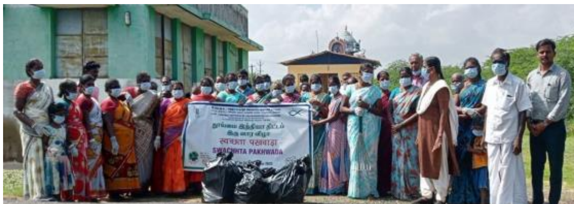
Cleaning of village streets by participants, Maathampattinam village, Sirghazi taluk of Mayiladuthurai district of Tamil Nadu