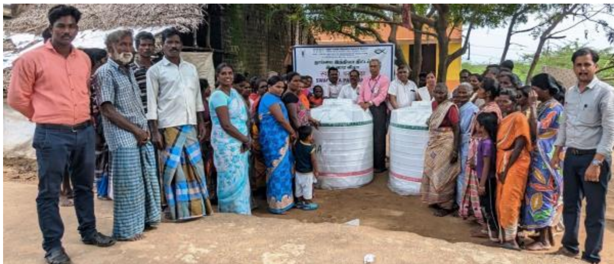
Awareness cum distribution of Materials to Villagers, Maathampattinam village, Sirghazi taluk of Mayiladuthurai district of Tamil Nadu