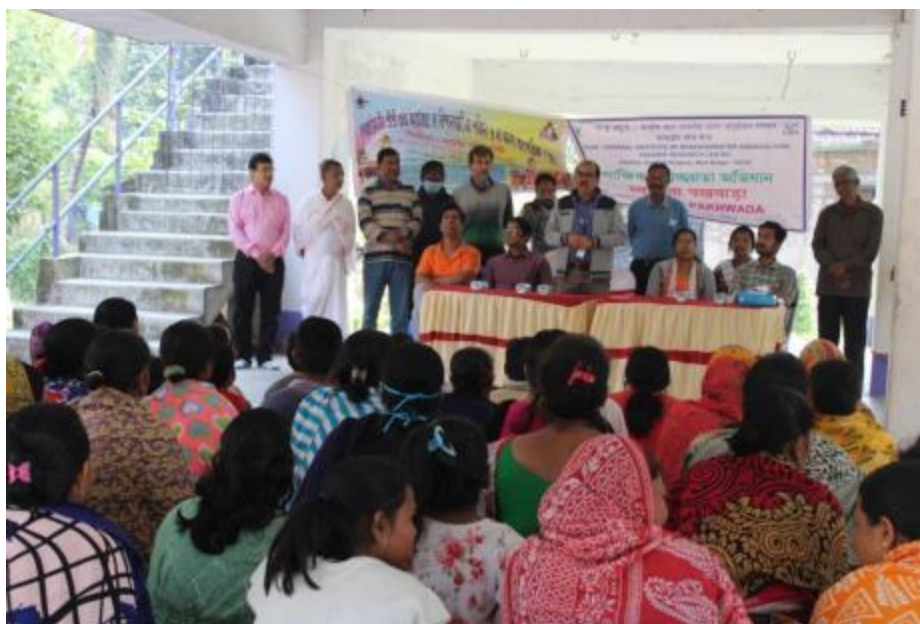
Awareness cum cleaning program in Haripur village, Kakdwip, West Bengal