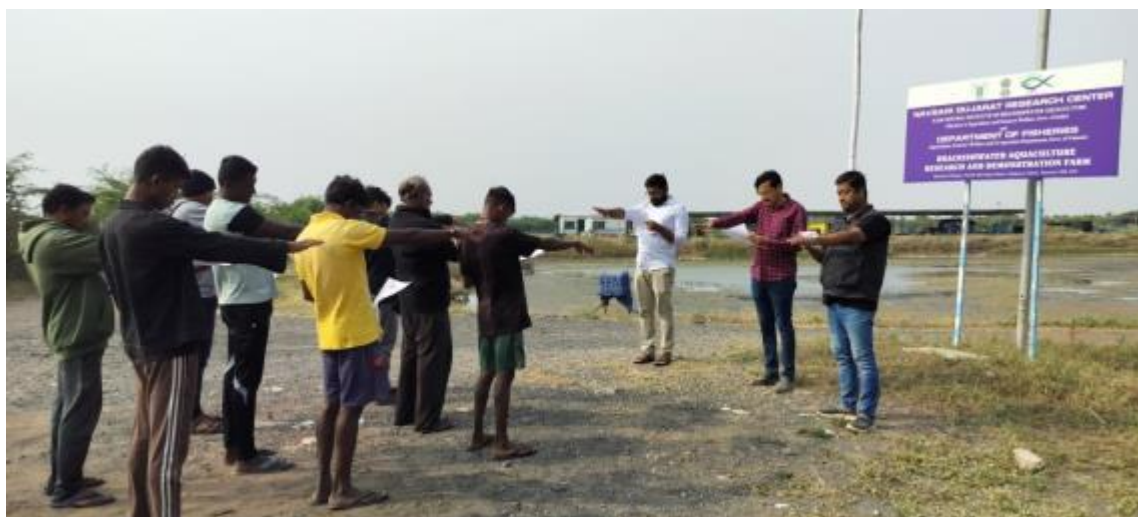
Swachhata Pledge at NGRC of CIBA, Navsari, Gujarat

The weeding out of the files and records from Stores, Administration, Audit and Accounts Section and Library and cleanliness drive in various laboratories and common places in the Institute premises including research centres at Gujarat and Kakdwip were undertaken. Unserviceable/scrap items to be condemned were identified and collected to a common place at Hqrs of CIBA, Chennai and going to be disposed as per the procedure. Around 64 CIBA staff and students were participant in these cleaning activities. The processing of files by the Administration, Audit & Accounts and Stores sections were carried out through e-office, being 100% implementation of e-office, this enabling paperless office.