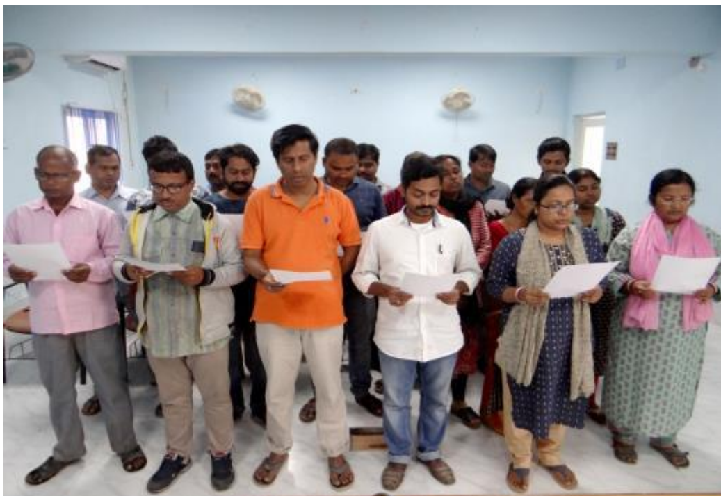
Swachhata Pledge at KRC of CIBA, Kakdwip, West Bengal