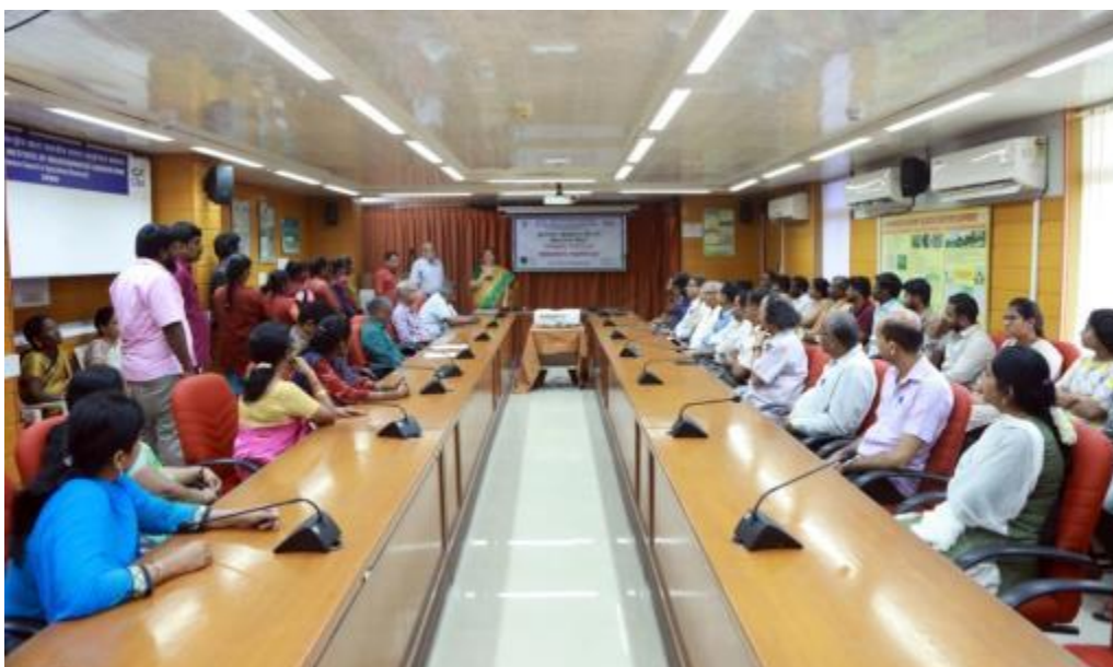
Awareness on single use plastic among staff and students at headquarters of ICAR-CIBA, Chennai