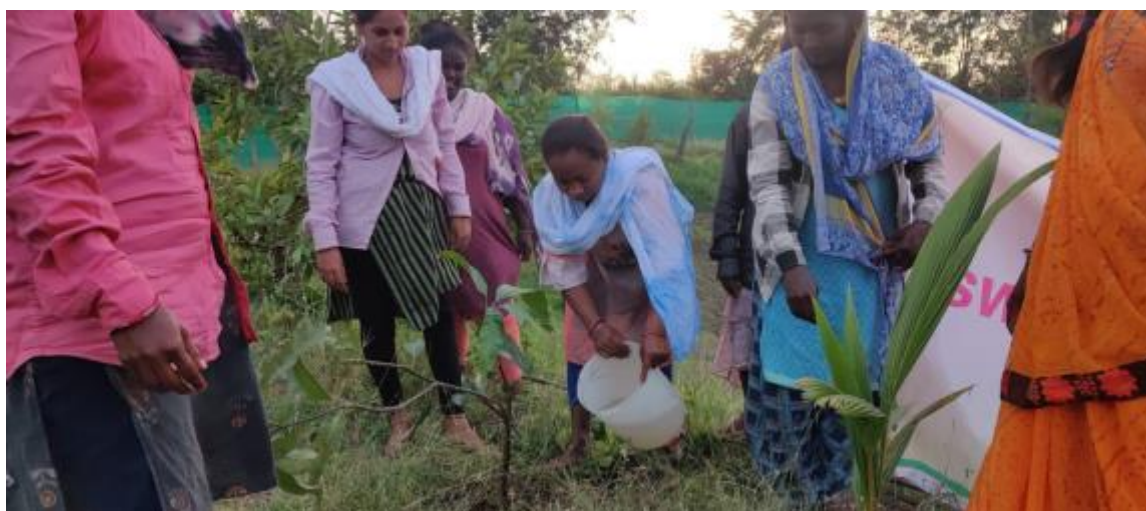
Planation of saplings by tribal farmers at Singod Village, Navsari, Gujarat