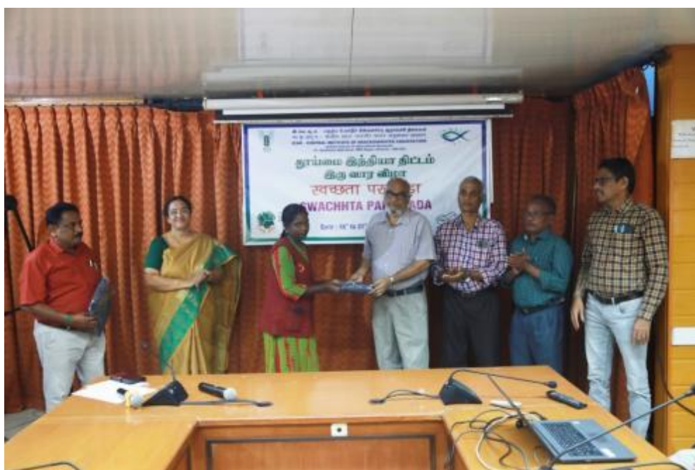
Distribution of rain coats to housekeeping staff at headquarters of ICAR-CIBA, Chennai