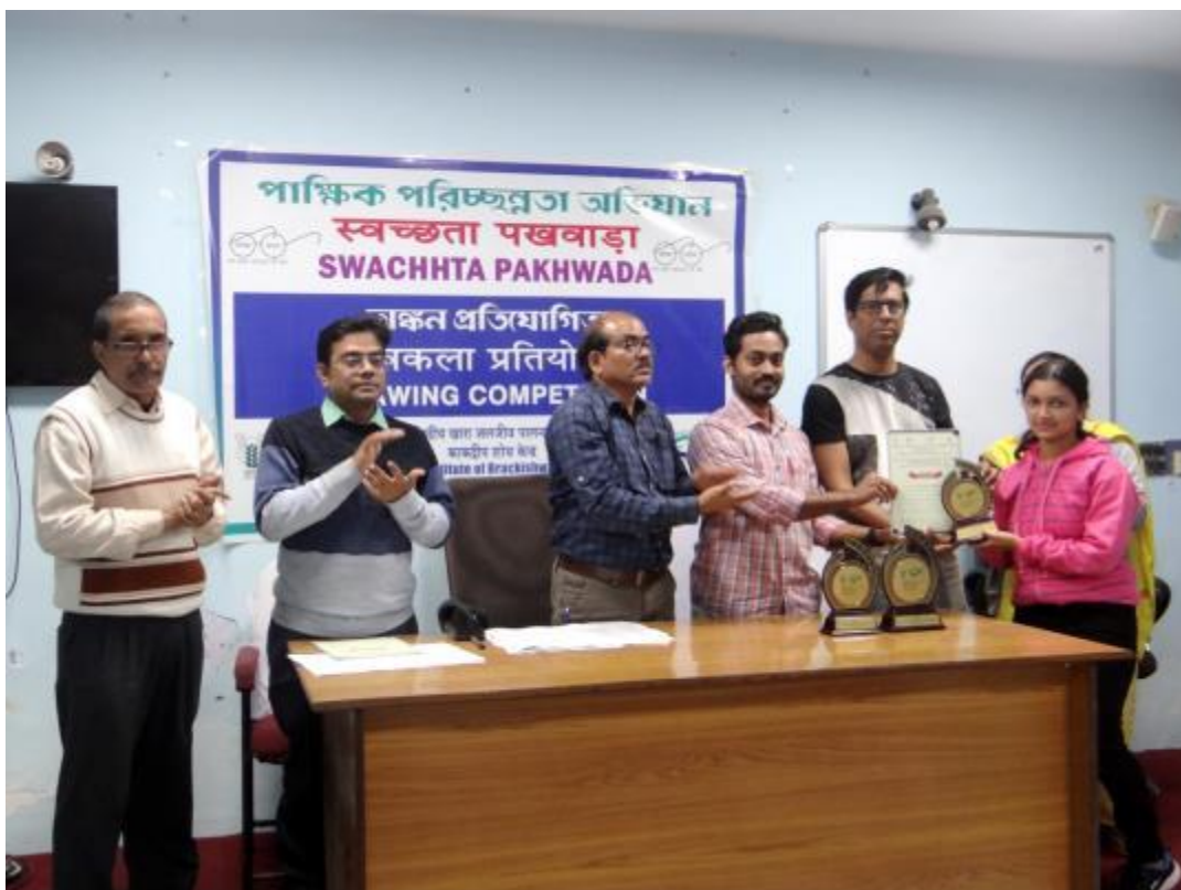
Prize distribution for drawing competition among students at Kakdwip Research Centre of CIBA, West Bengal