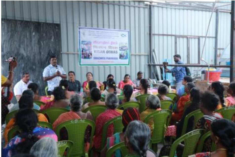
Sharing of experience of farmer who is producing Plankton Plus , a product developed from fish waste - ICAR-CIBA, Chennai