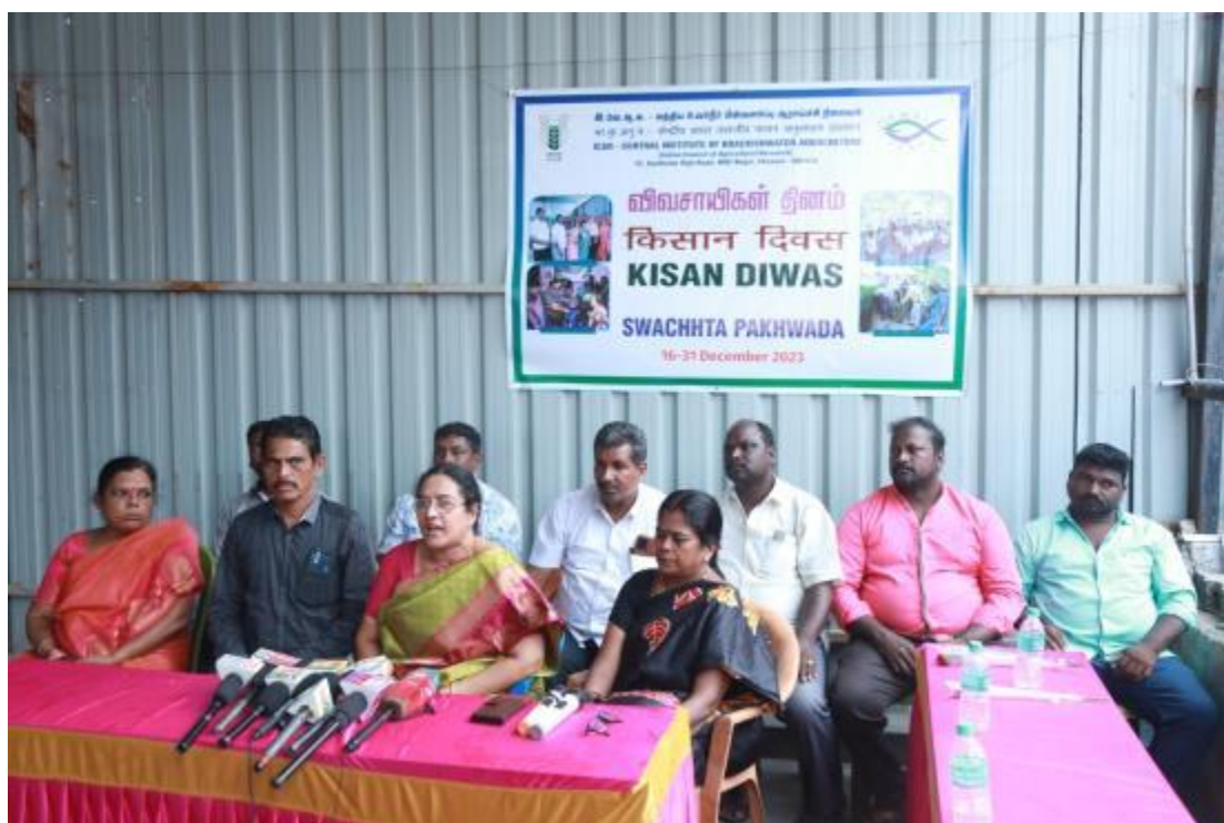
Press and Media coverage about Kisan diwas and fish waste to wealth initiatives by CIBA at Kasimadu, Chennai, Tamil Nadu