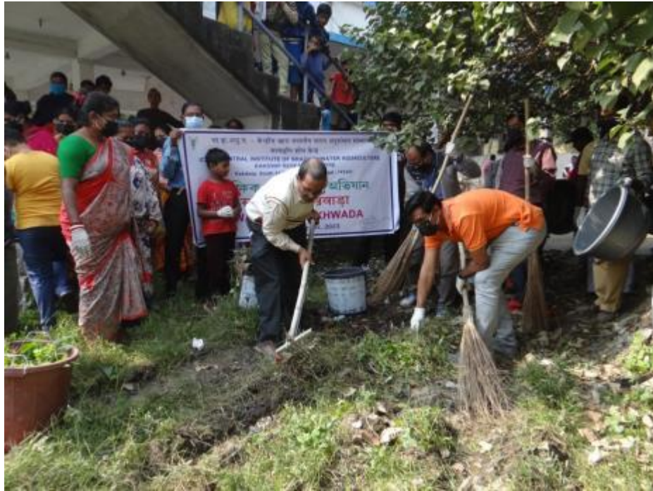
Cleaning drive in Haripur village, Kakdwip, West Bengal