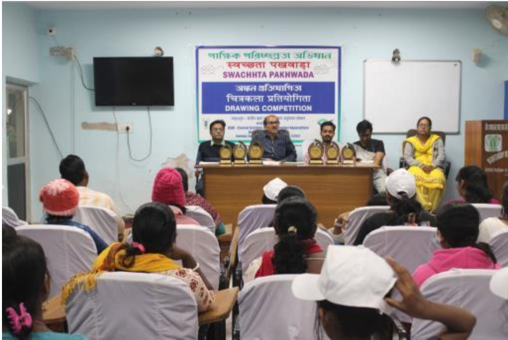
Awareness and drawing competition among staff and students at Kakdwip Research Centre of CIBA, West Bengal