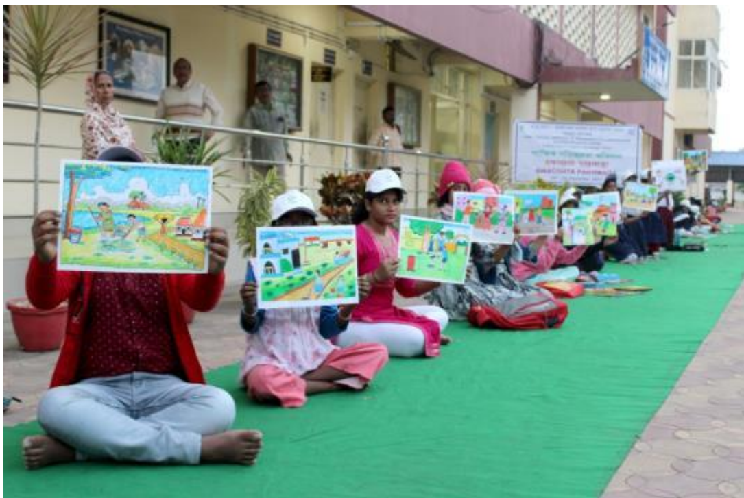
Drawing competition among students at Kakdwip Research Centre of CIBA, West Bengal