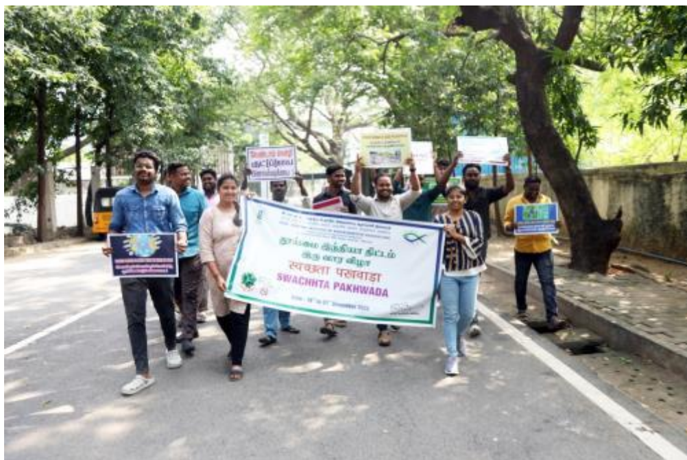
Rallies on shun single use plastics at M.R.C Road, ICAR-CIBA, Chennai