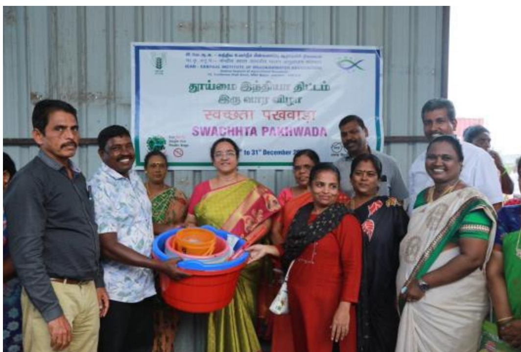
Distribution of cleaning materials to fish waste processing unit at Kasimadu, Chennai – CIBA, Chennai