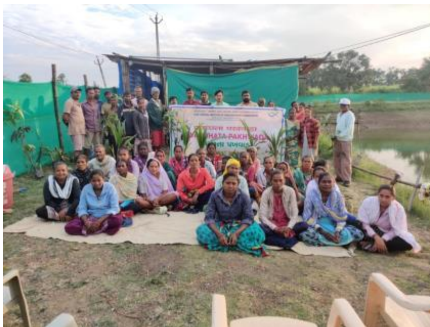
Awareness programme on Kitchen gardening and distribution vegetable saplings at Singod Village, Navsari, Gujarat

kitchen garden for cultivation of horticultural crops that provide extra incomes, meet up domestic needs for vegetables and nutrition, and create clean and esthetic surroundings of a house. This would also help in keeping house premise weed free and maintaining healthy organic environment. Therefore, maintenance of kitchen garden as a household activity by small and marginal farmers is promoted in the adopted tribal village and tribal farmers are doing kitchen garden with the help of CIBA- NGRC Centre. As a part of the Swachhta Pakhwada programme, villagers participated in the horticulture activity and cultivation of crops on the pond dykes and with irrigation from harvested pond water.