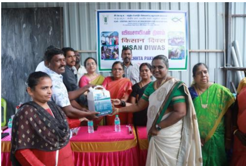
Plankton Plus , a product developed from fish waste was handed over to the Shri A.M.M. Murugappa Chettiar Research Centre, Chennai, Tamil Nadu, – CIBA, Chennai