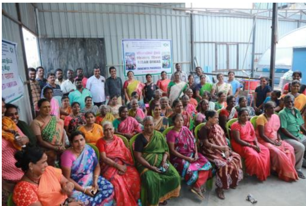
National farmers day or Kisan Diwas, Kasimedu fishing harbour, Chennai, Tamil Nadu

Around 150 fish farmers including local fishermen cooperative society members, panchayat representatives, press and media, MCRC team, and CIBA team participated in the programme. During the programme, Plankton Plus was handed over to the MCRC who is going to apply CIBA-Plankton Plus in the paddy farming. At the end of the event, CIBA has distributed the plastic waste collection bin and cleaning materials to fishermen cooperative society representatives and fish waste processing unit for cleaning the work and village premises.