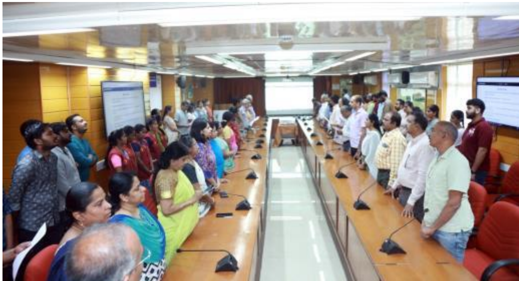
Swachhata Pledge at ICAR headquarters, Chennai, Tamil Nadu

materials, awareness creation, promoting individuals responsibility and monitoring and implementation of the programmes like “Clean India” are the measures for beating the plastic pollution. In addition, cleaning of office premises were undertaken and unserviceable equipment and unrepairable furniture were identified and taken necessary action for disposing of the same.